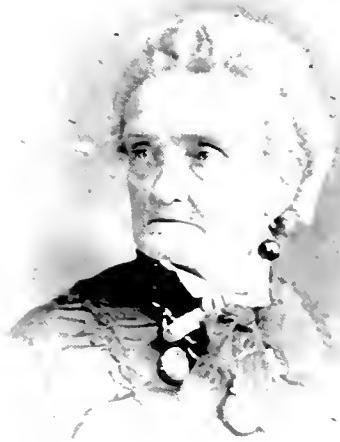
CHARLOTTE SAUNDERS CUSHMAN.

1845. She returned to the United States in 1850, and played a second season in England in 1853. She played important engagements in the United States in 1857 and 1858, and again in 1859 and 1861.